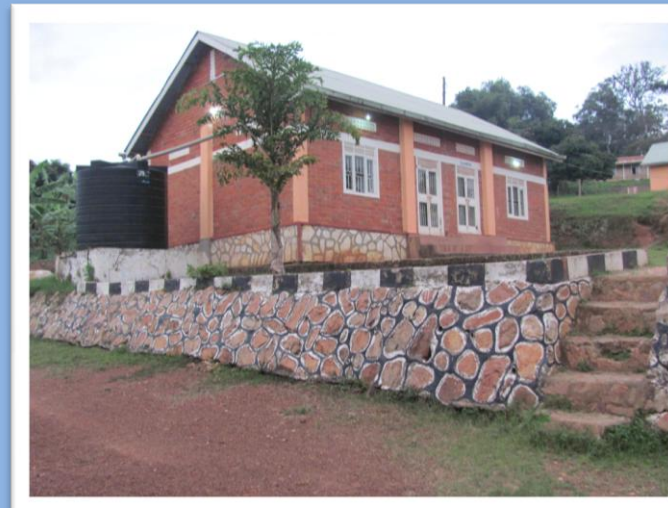
Vocational Block C