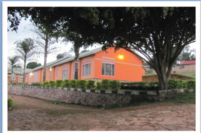
Vocational Block A