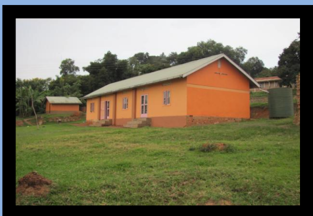
Inset building is the RYDA Clinic