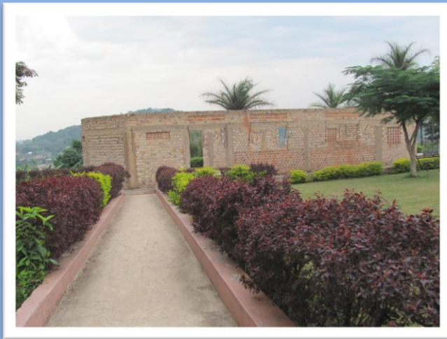
Kasubi Hall under construction