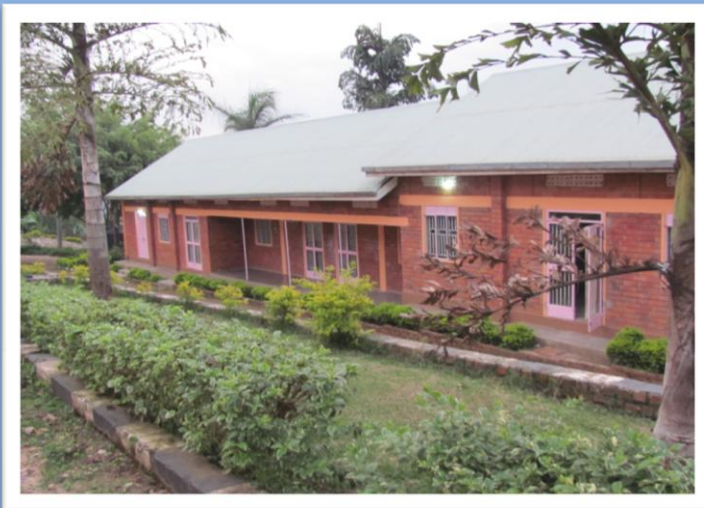
Vocational Block B