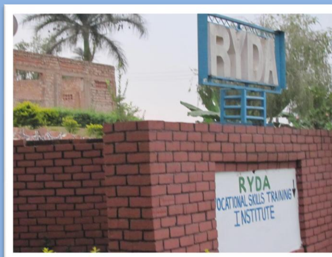
RYDA Main entrance

The above pictorial view shows the RYDA Training Centre Canteen and Office. This is where the day today work takes place and it is where the acquired materials, equipments and tools will be placed to facilitate RYDA activities/programmes.