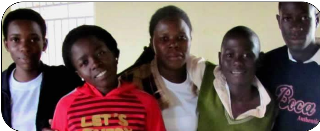
Some of the direct beneficiaries of the ILO IPEC SNAP project