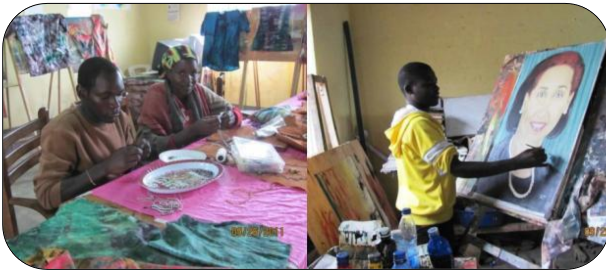
Art and Design Students During their training Session