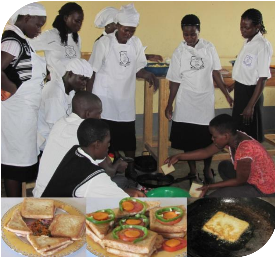
Catering and Hotel Management Students get their Hands on with their Instructor.