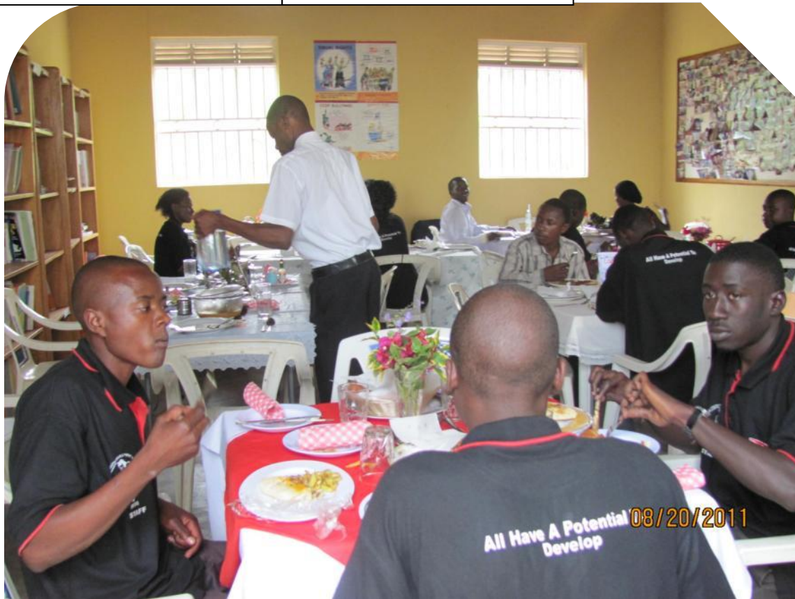
RYDA Staff members enjoying their Lunch