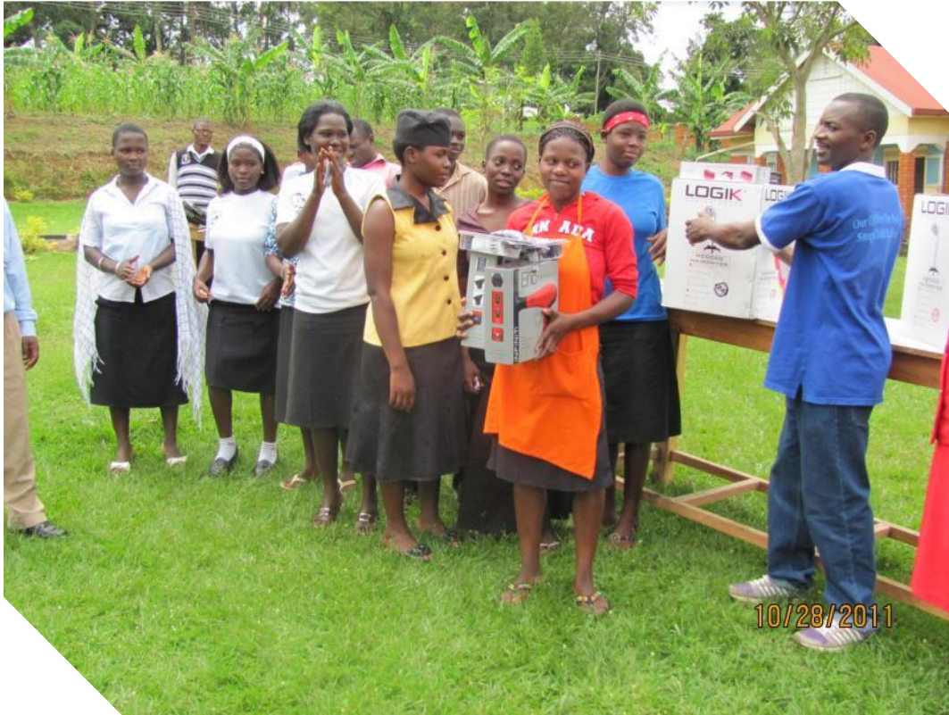
Excited Ex-child labourers receive their resettlement kits at RYDA center