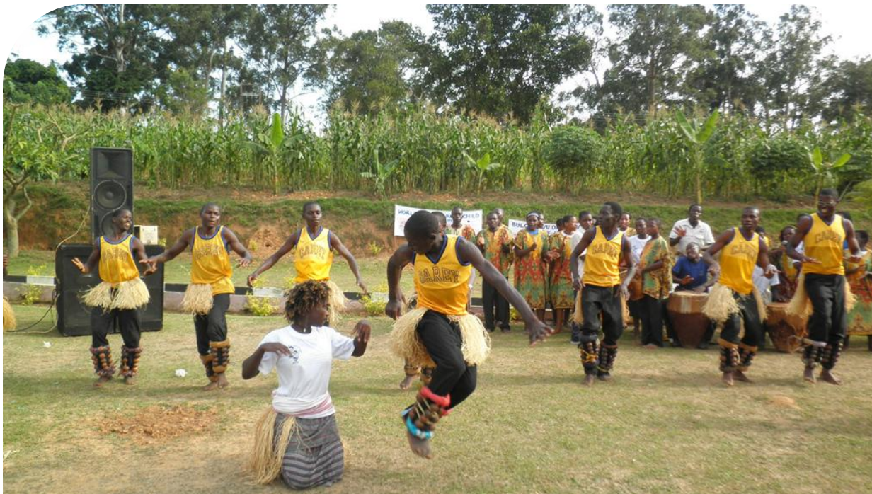
Ending a year successfully is an excitement to the RYDA Students. Photo show such