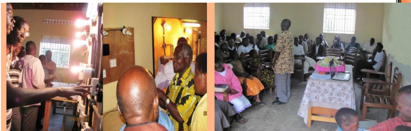
Sharing Experiences with other stakeholders

A total of 120 sub-county councilors 84 females and 36 males have been trained. 117 have been trained in Psycho-social support 333 have been identified, selected and provided with scholastic materials, counseling and psycho-social support.