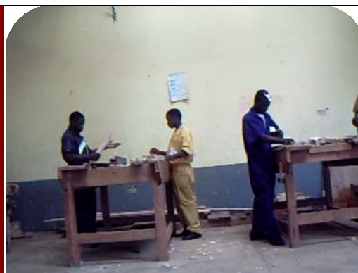
Carpentry Students in action