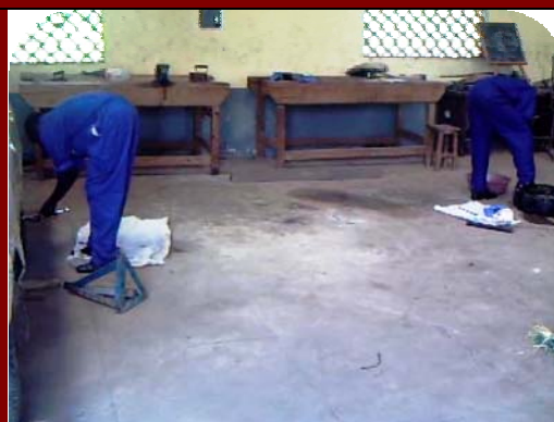
Motor Vehicle Mechanics student in practical

Despite a successful DIT examination, five (5) trainees were retained as they were still young to let them go for work; under the resetting programme.