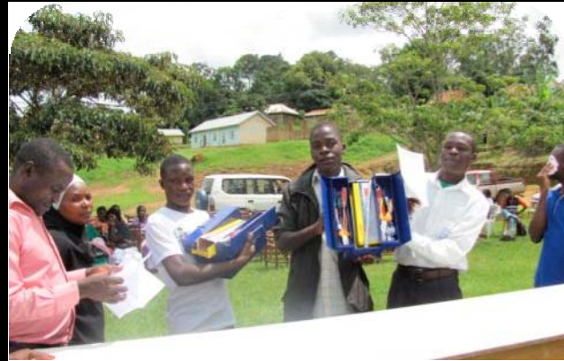
Motor vehicle students well equipped and ready to start...