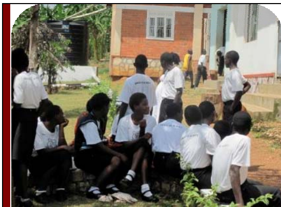
Students in preparation for their exams

Below are some of the pictorial views showing trainees undergoing Trade Testing Examination:-