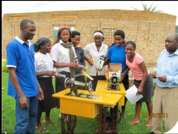
Students of Tailoring receiving their equipments