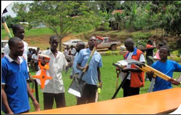
Brick laying and concrete practice students show off what they received