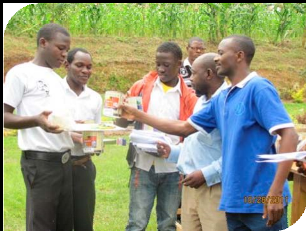
Art and design also received what could get them