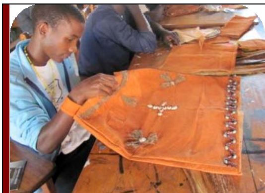
Art Students in action