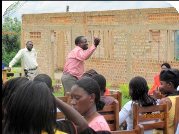
Executive Director of RYDA addressing ex-child labourers and parents