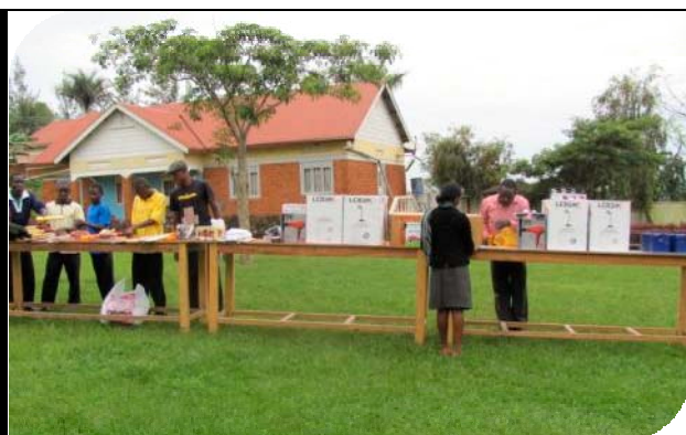
Preparation of resettlement kits

Despite a successful DIT examination, five (5) trainees were retained as they were still young to let them go for work; under the resetting programme.