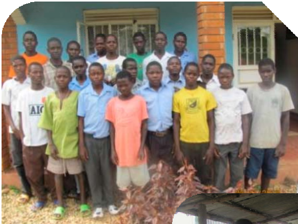
A group photograph of the some trainees one week at the RYDA centre

Training young people with different educational back ground requires a well thought out methodology to enhance a better understanding of the course content.