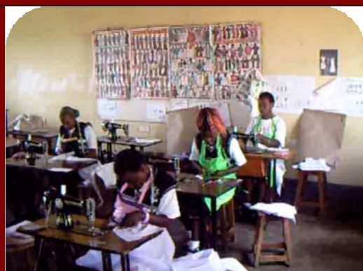
Some of the Tailoring Students in action