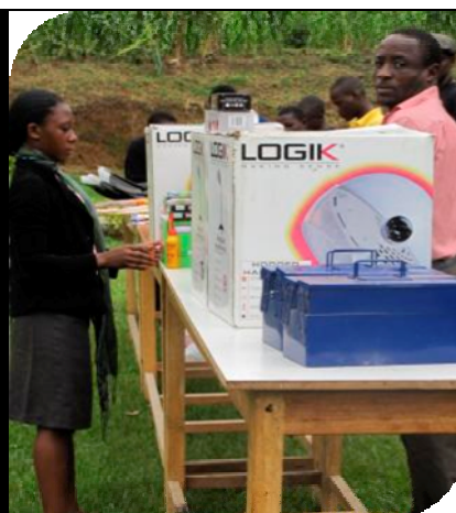
Preparation process of resettlement kits