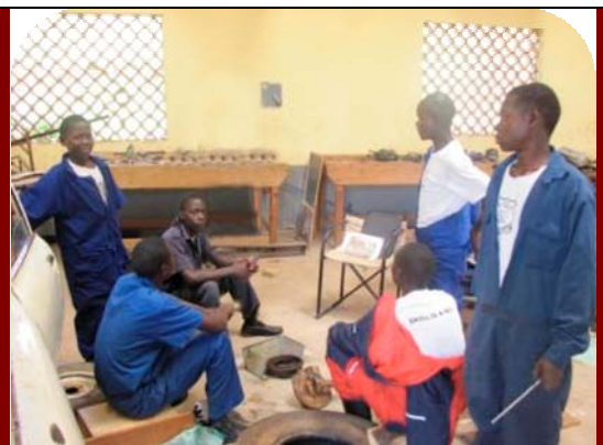
Motor Vehicle Students ready for their exam