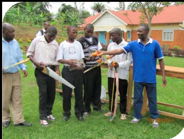
Carpentry students receiving their tools