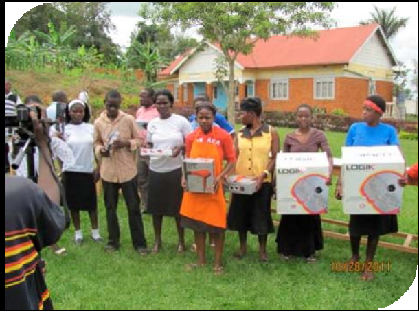
Students of hair dressing receiving their equipments